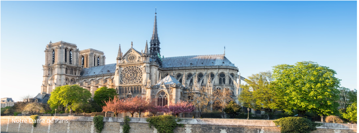
Notre Dame de Paris